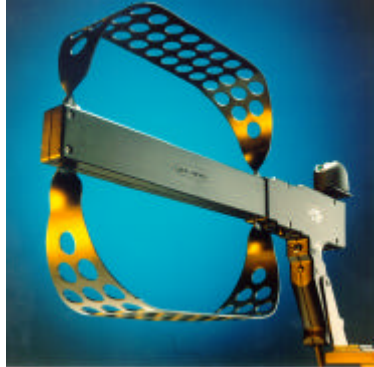
20 to 200 Mhz