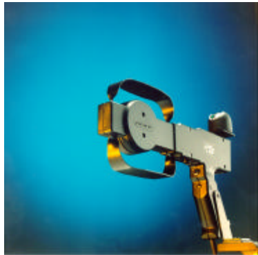
200 to 500 Mhz